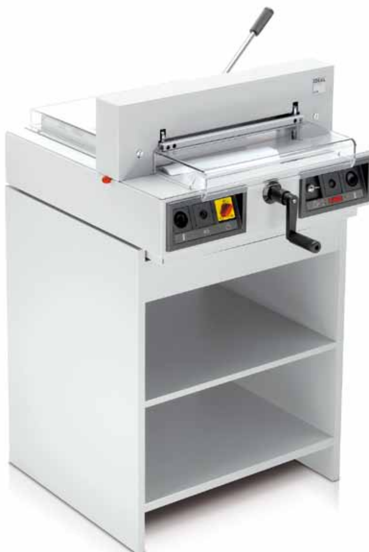
IDEAL 4315 with optional cabinet